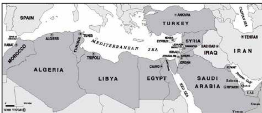
Figure 1. Countries declaring new interest in civilian nuclear programs, 2006-2007 7

those with growing energy needs, began reconsidering the merits of civilian nuclear reactors. This paper does not test hypotheses, and as such, it cannot entirely rule out this alternative explanation. However, a brief assessment casts grave doubt that this alternative can account for all of this sudden interest. For instance, if a nuclear renaissance were the driving factor, then other regions should have seen similar bursts of interest in civilian reactors. Yet of all 53 countries that have expressed interest recently in nuclear energy, 16 of them (i.e., 31 percent) are in the Middle East – more than in any other single region. 5 Likewise, the Middle East has a far higher percentage of such countries than any other region (only two countries, Iraq and Lebanon, have not expressed such interest). Finally, if the interest in nuclear energy were based on innocent intentions, we would anticipate that the Middle East countries with the largest energy surpluses would be the least likely to express interest in nuclear energy. However, interest in nuclear energy has no apparent correlation with energy resource possession, meaning that energy rich countries are just as interested in nuclear energy as energy poor ones. 6